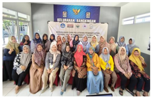
Figure 4. implementation of herbal outreach