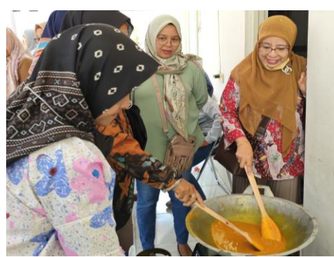
Figure 5. The process of making granules from curcuma

The next workshop is about soaking feet with herbal ingredients. The ingredients used are ice cubes, salt, dry dlingu, and apple cider vinegar. This herbal ingredient is very effective in improving blood circulation, especially for people who often have tingling in the feet area. Soaking your feet should be done at night or before bed. This is because at night the muscle, skeletal and circulatory systems are in a relaxed state, giving rise to a comfortable feeling when you wake up.